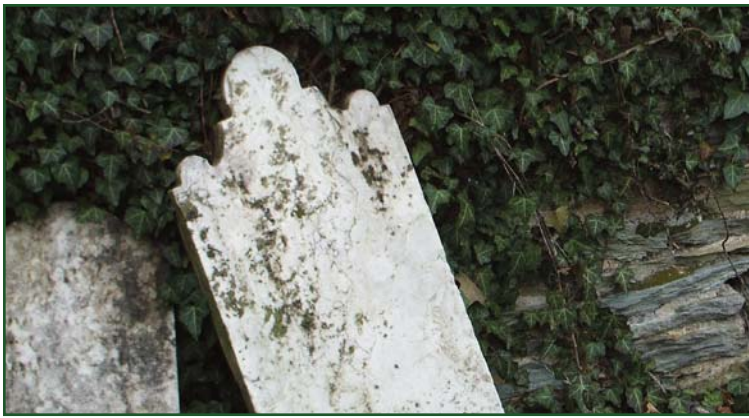
A pair of illegible tombstones in Harper's Ferry Cemetery.

(If lying down)-the Suffering of Christ, (If standing)-Christ Risen