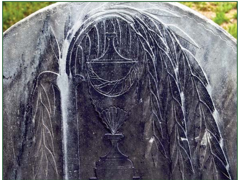
Weeping Willow Tree with Urn.