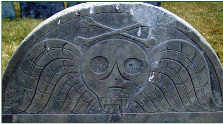
Classic "Death's Head" with wings motif.