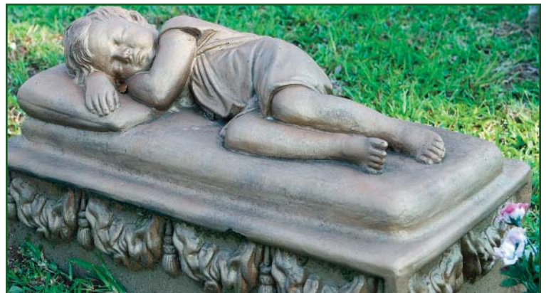
Sleeping Child Tombstone typical of the Victorian Era.

Skull: (Sometimes winged)-Sin, (With Crossbones)-Mortality of Humans, (On Pillar)-Triumph of Life, (Wearing Wreath)-Victory of Death over Life